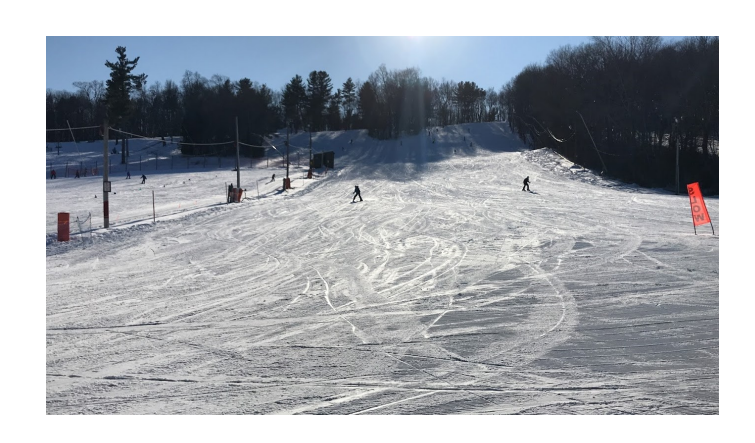
DRACUT RECREATION SKIING & SNOWBOARDING AT BRADFORD 2024 Saturdays, 5:00PM—9:00PM

REGISTER/PURCHASE TICKETS: Online registration: October 20 -December 15